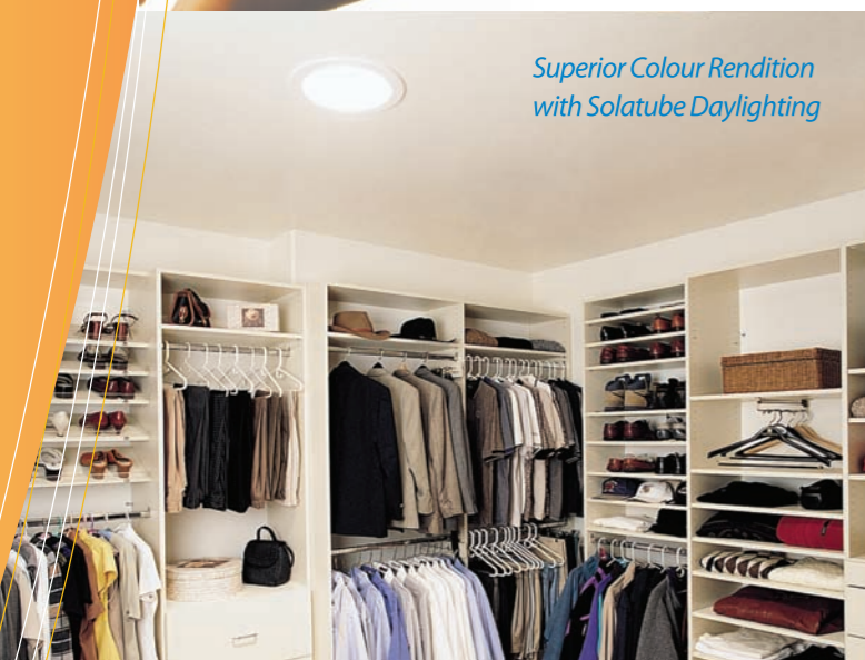
Superior Colour Rendition with Solatube Daylighting

Green building technologies are a growing trend and valuable selling-points. Daylit high performance buildings offer an increased return on an owner's investment through the building's increased overall asset value at no additional construction cost.