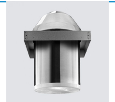
Open and closed ceiling configurations