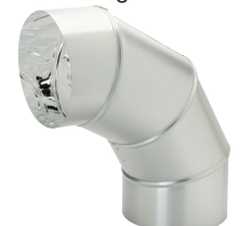
0-90 degree bend