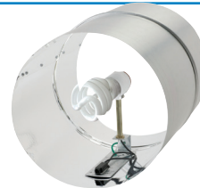
LED light kit