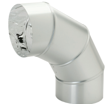
0-90 degree bend