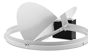
Solar daylight dimmer 0-10V dimmer