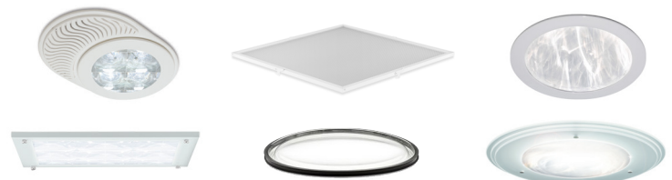
A variety of additional lenses, diffusers, square options and thermal panel