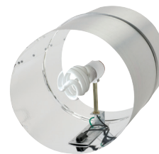
LED light kit