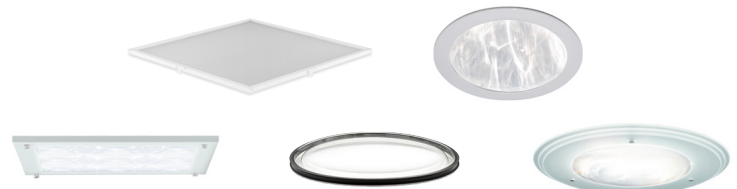
A variety of additional lenses, diffusers, square options and thermal panel